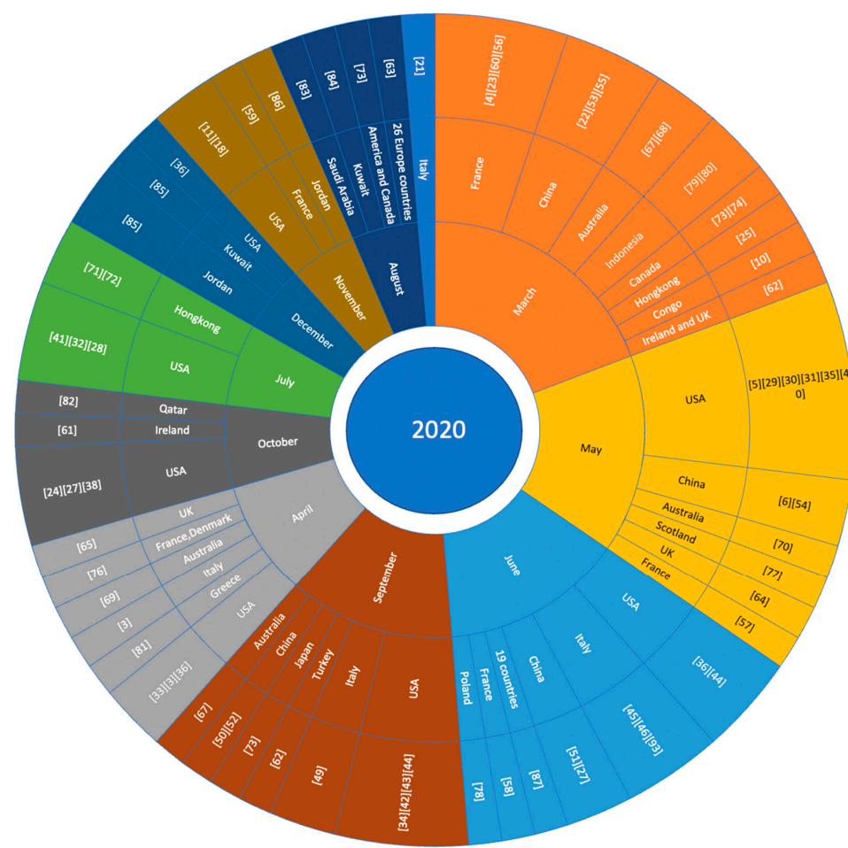
Figure 2. Studies conducted in 2020.

80 studies were conducted in 2020, and only two studies were performed in 2021. The highest number of studies were carried out in the USA ( n = 23 ). In Italy, 10 studies were conducted; eight studies were conducted in France and China, and six studies were conducted in the UK. In both Australia and Hong Kong, four studies were performed, in both Canada and Turkey two studies were conducted, and in the remaining countries (Japan, Saudi Arabia, Ireland, Qatar, Poland, Kuwait, Congo, Jordan, Greece, and Poland) one study was conducted in each. One study included all 26 European countries in the survey. Another study included 19 countries from around the world. Among the 23 studies in the USA, 16 studies were conducted for the general population, two studies were conducted for students, three studies were conducted for healthcare workers (HCWs), and two studies were conducted for people suffering from serious health issues. Among the 10 studies in Italy, seven studies included the general population. Students, HCWs, and people at high risk were included in one study each. Among the eight studies in China, seven studies were based on the general population, and the remaining study included HCWs. Most of the studies were carried out in various countries and included the general population, highlighting the widespread perception of vaccination.